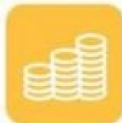
Economic and Community Development