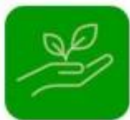
Supporting the Environment

Our Rotary Clubs fundraising efforts support our local community with the focus on the Rotary International Seven Areas of Focus. These include: