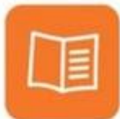
Basic Education and Literacy