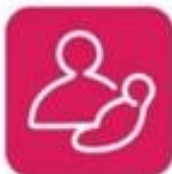
Maternal and Child Health