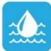
Water and Sanitation