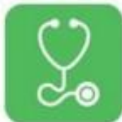
Disease prevention and treatment