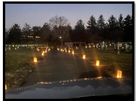
Luminaires are out at Rosedale. Praise God the wind is not blowing! This is a FCA Interact project. (Shared by a Fellow Rotarian)